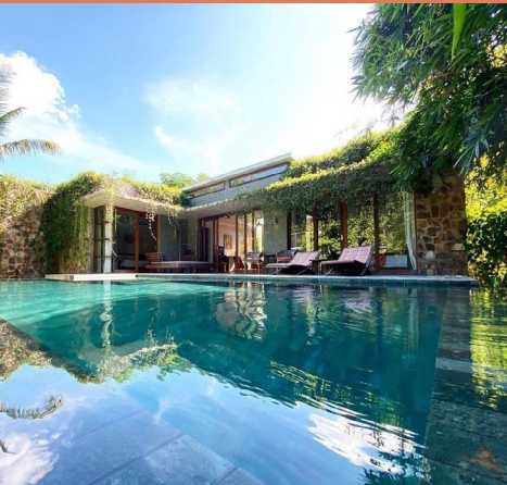
THREE-BEDROOM VILLA (247 sqm*)