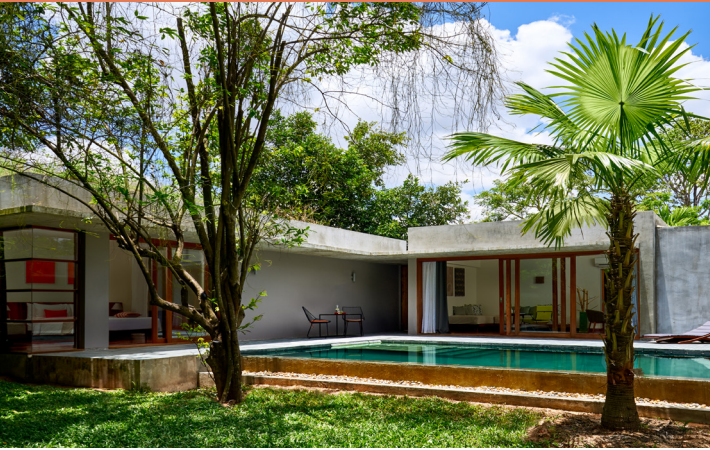
PRIVATE POOL ONE-BEDROOM VILLA (70 sqm*)