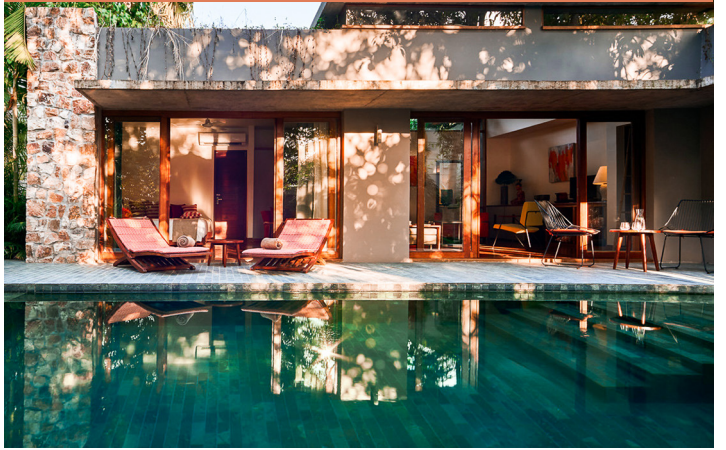
PRIVATE POOL TWO-BEDROOM VILLA (104 sqm*)