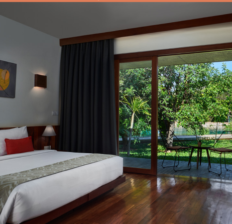
JUNIOR SUITE (40 sqm*)